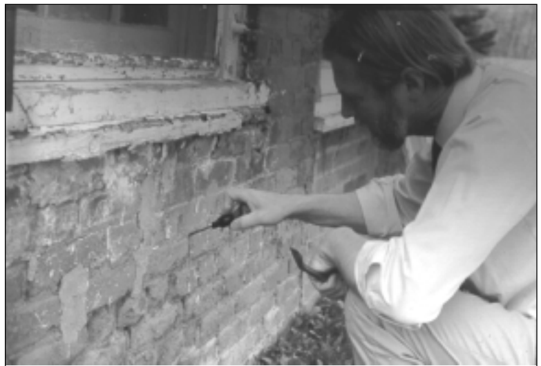
SHPO, MHS; photograph by Charles Nelson

The most common point of entry for water is the mortar joint. Mortar bonds the units together; it must be strong enough to maintain this bond, but it also must be flexible enough to allow the structure to “breathe” in response to natural temperature fluctuation. Wind and rain cause erosion of the mortar, exposing sand aggregate. Continual erosion results in the receding of the mortar, resulting in open penetrations into the wall. When water enters these openings, it may saturate the interior and may freeze. When water freezes, it expands, driving the joint