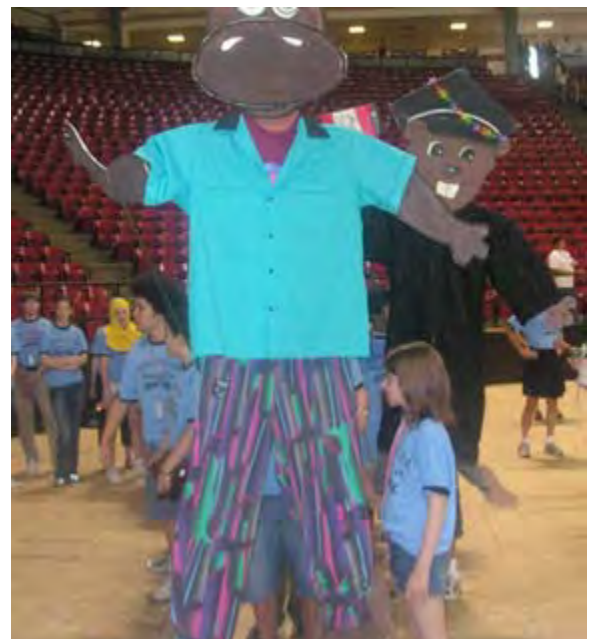
Big Moose and Big Gopher make the rounds at the award ceremony.