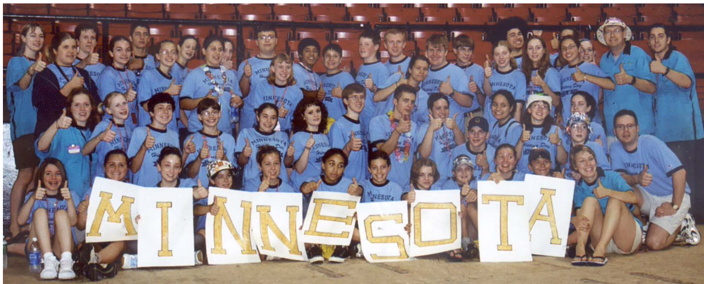
The Minnesota History Day Delegation poses for a team picture before the Thursday morning awards ceremony.