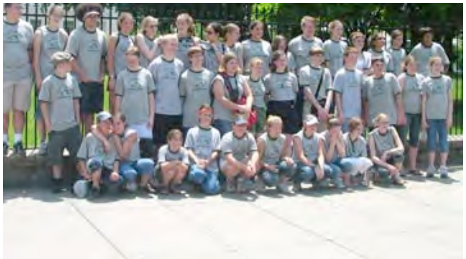
Despite the heat, Minnesota History Day scholars find time to pose for a picture in front of the White House.