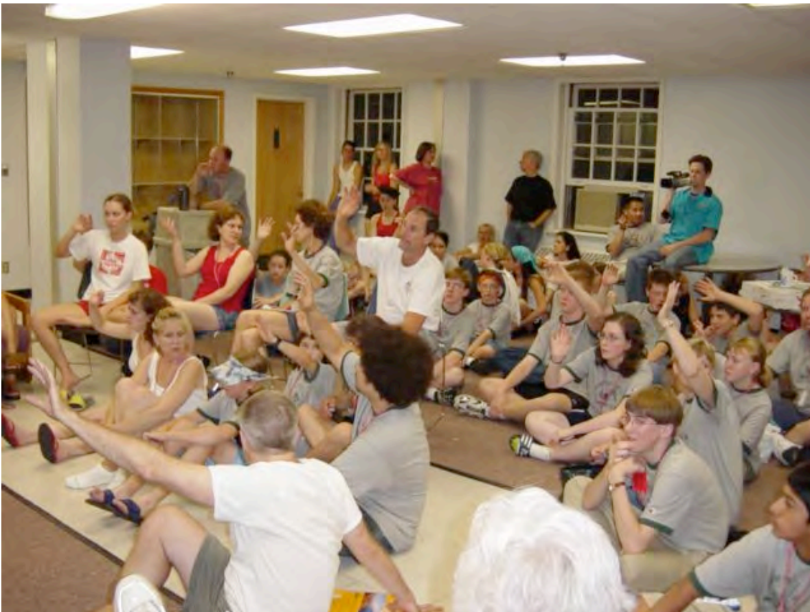
The Minnesota History Day Delegation during the Sunday night meeting