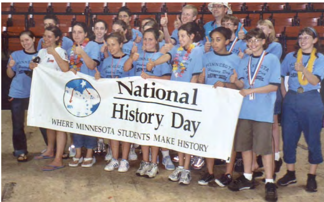
Minnesota National History Day Award Winners give the History Day thumbs up with Mr. History. Thursday June 19, 2003

Scores of History Day students, parents, teachers and staffers took time out of their touring schedule Wednesday to attend a series of meetings on Capitol Hill. The purpose of these meetings was to secure support for History Day from Minnesota’s congressional delegation by raising awareness of the valuable program. Few elected officials from the Land of 10,000 Lakes were able to avoid the powerful grassroots force. The meetings today with Senator Mark Dayton, Congressmen Jim Ramstad, Martin Sabo, Jim Oberstar and Congresswoman Betty McCollum followed on the heels of Tuesday’s successful meeting with Senator Norm Coleman. Camp History Day Bulletin sources reported that several students, who either are considering future employment as lobbyists or confused these congressional meetings with room judging, slipped the Minnesota dignitaries bottle-cap trading buttons under the table. No word on whether the bribes were successful. Congressional staff members took several of the groups on tours of the Capitol building following the meetings, and among the high-ranking officials reportedly seen by tour-groups in the Capitol were Senator Elizabeth Dole (yes she does have braces) and Speaker of the House Dennis Hastert.