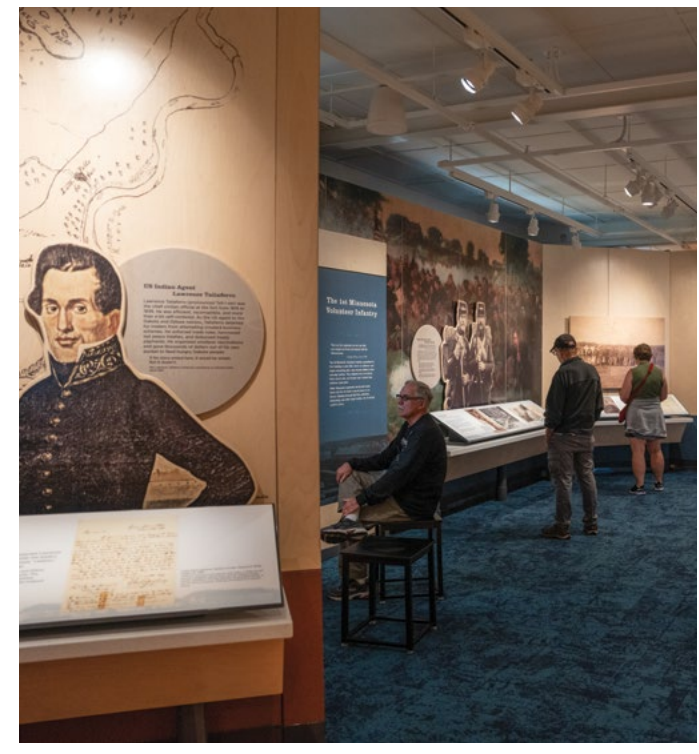
Visitors inside Many Voices, Many Stories, One Place at Historic Fort Snelling.

Not only does Many Voices, Many Stories, One Place elevate hidden histories, diverse stories, and nontraditional expertise, but it also encourages a better understanding of how history is created and recreated with each generation. The exhibit is located in the Plank Museum and Visitor Center, which opened in May 2022, and is open to visitors year-round.