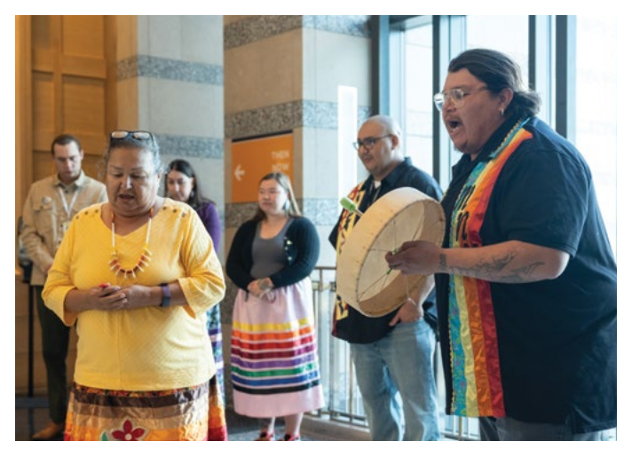
Celebration of the opening of Reframing our Stories exhibit, October 21, 2023.