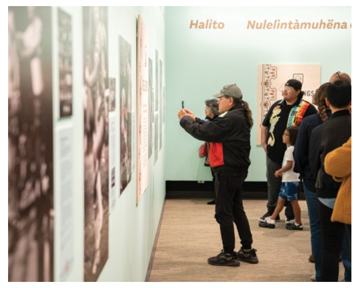
Visitors enjoy Reframing our Stories exhibit on opening day, October 21, 2023.